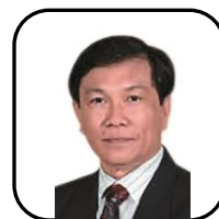
Ismael Tabije Club Service